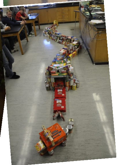
Last year's entries in our United We Can Contest. The previous page features the People's Choice Winner New Richmond Middle School.